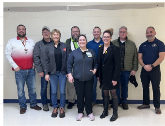
Our fabulous presenters